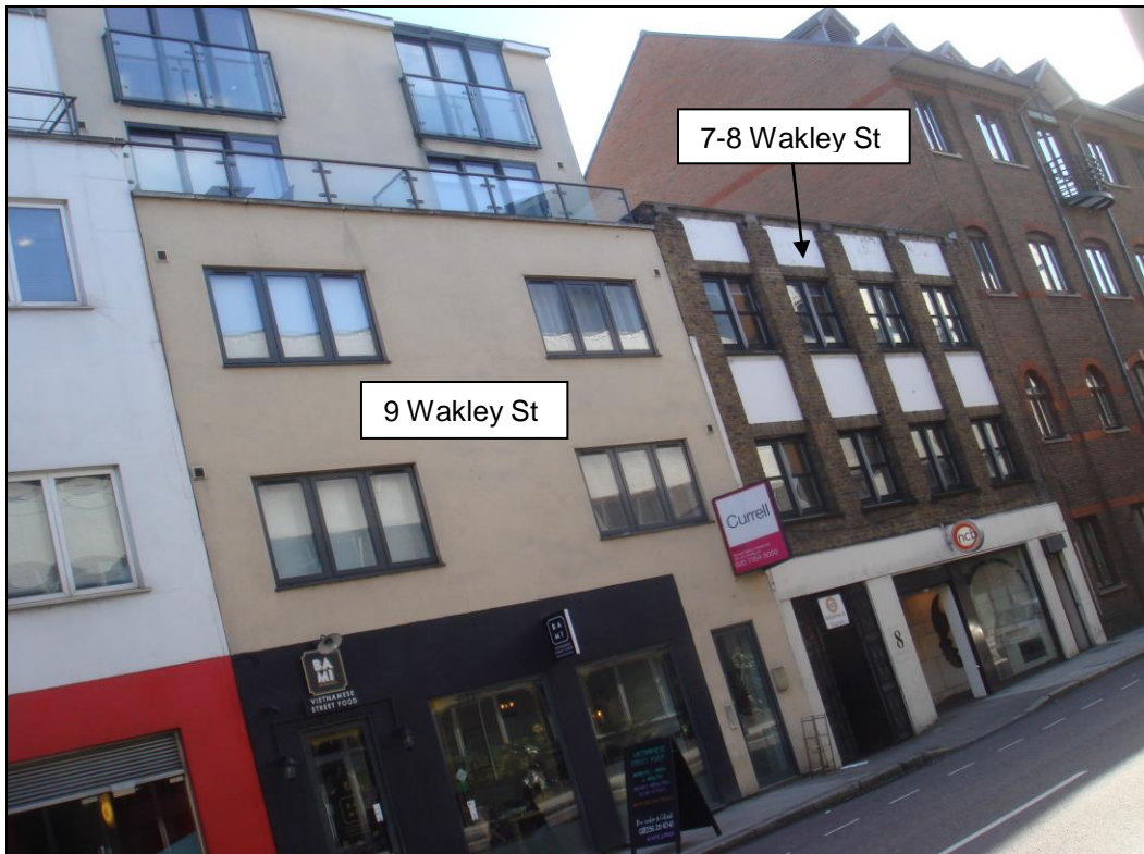
Photograph 2: Wakley Street frontage