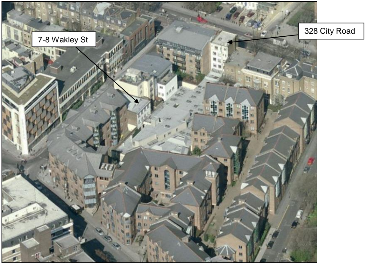
Photograph 1: Aerial view of site and surroundings