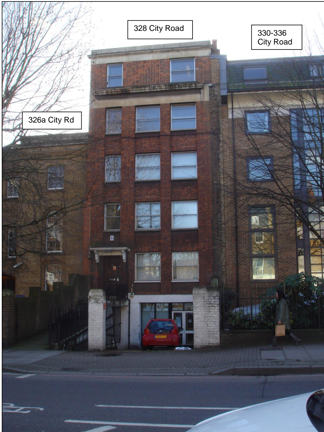
Photograph 3: City Road frontage