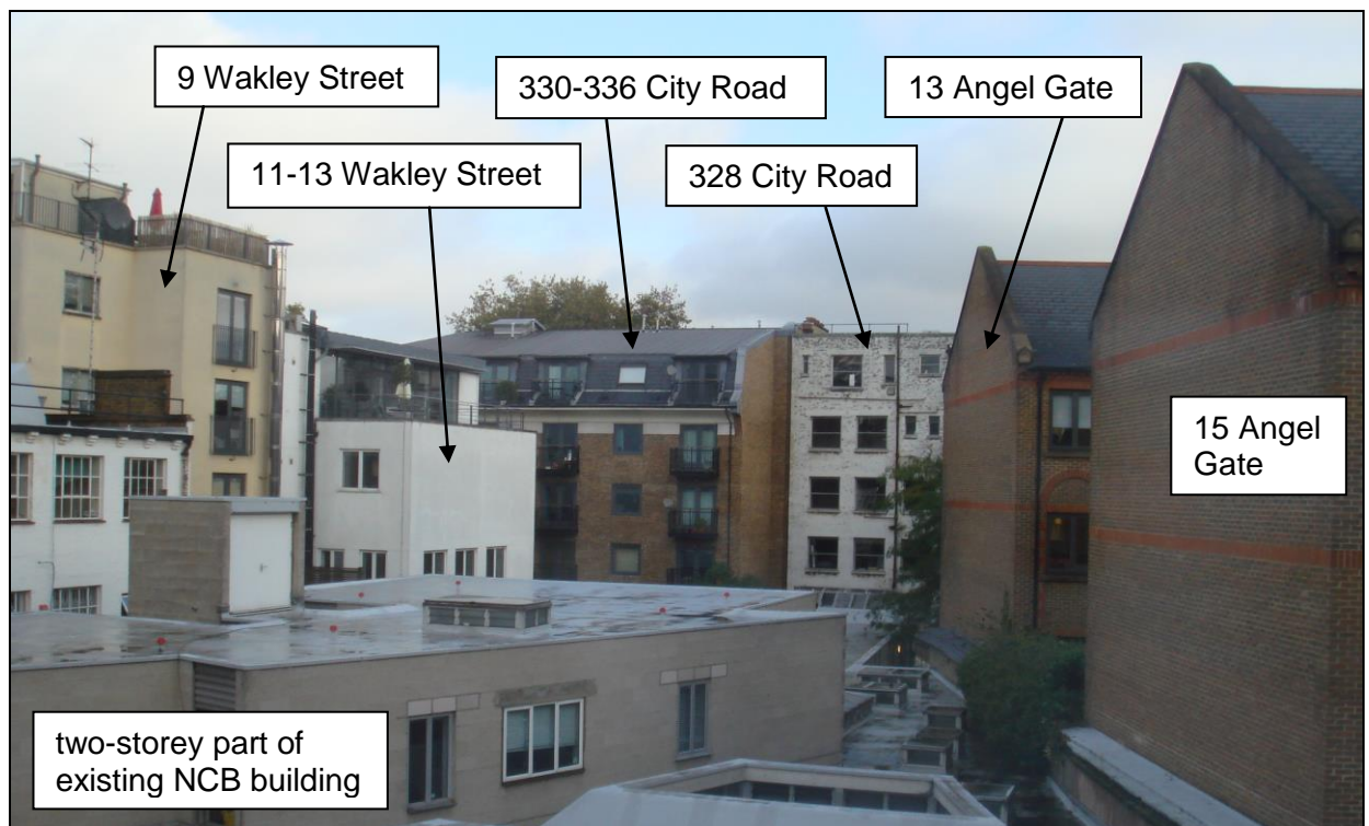
Photograph 4: view north from Angel Gate

ground floor window W6/2899 (which is overhung) would see a VSC reduction from 12% to 9% (a 25% reduction), whereas the adjacent window W5/2899 (which is not overhung) would see a VSC reduction from 16.5% to 15% (a 9.1% reduction).